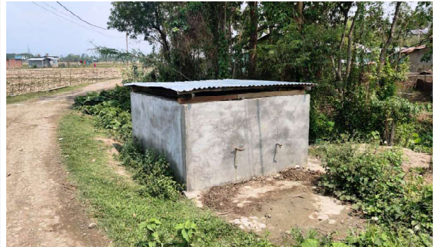
Water reservoir tank at Laikangbam Leirak Ward No. 2

Water reservoir tank constructed at Lamshang Assembly constituency remain unused even after completion of 2 years