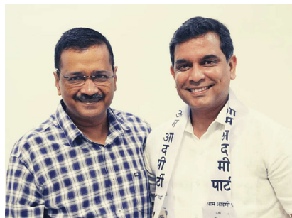
Delhi Chief Minister Arvind Kejriwal with Amit Palekar

"There is a wave of change in Goa, Aam Aadmi Party has now settled in the hearts of the people of Goa. There is no place for corrupts and